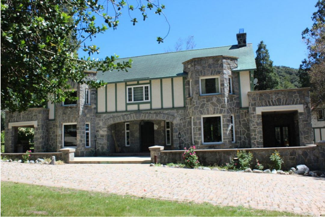
Baumann Manor, Oak Glen, San Bernardino County