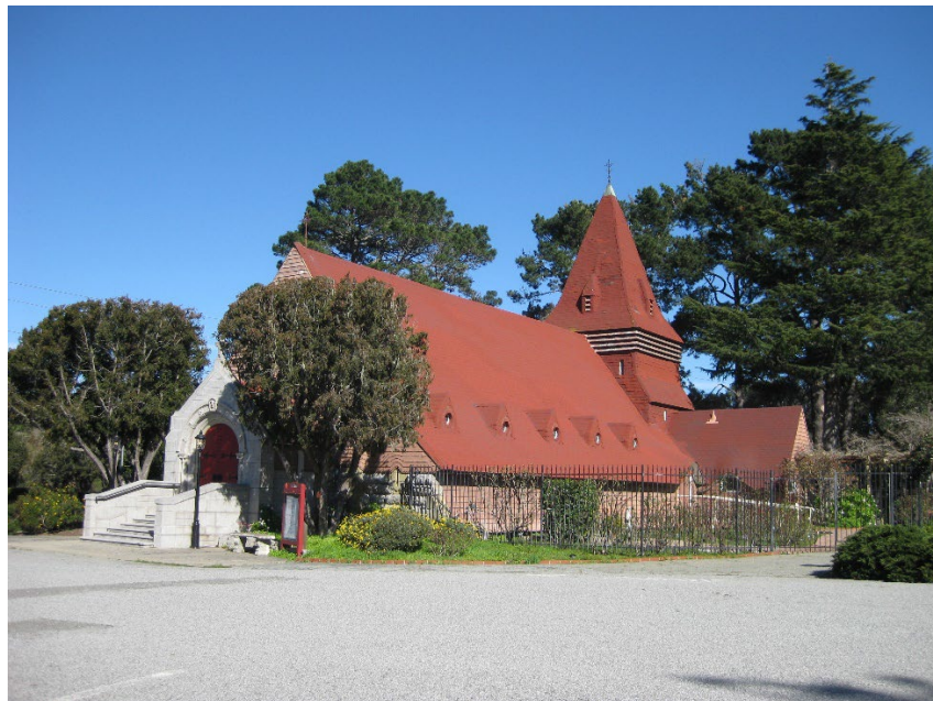
St. John's Chapel Del Monte, Monterey, Monterey County