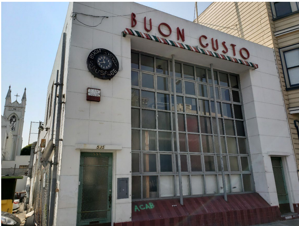
Buon Gusto Sausage Factory, San Francisco, San Francisco County