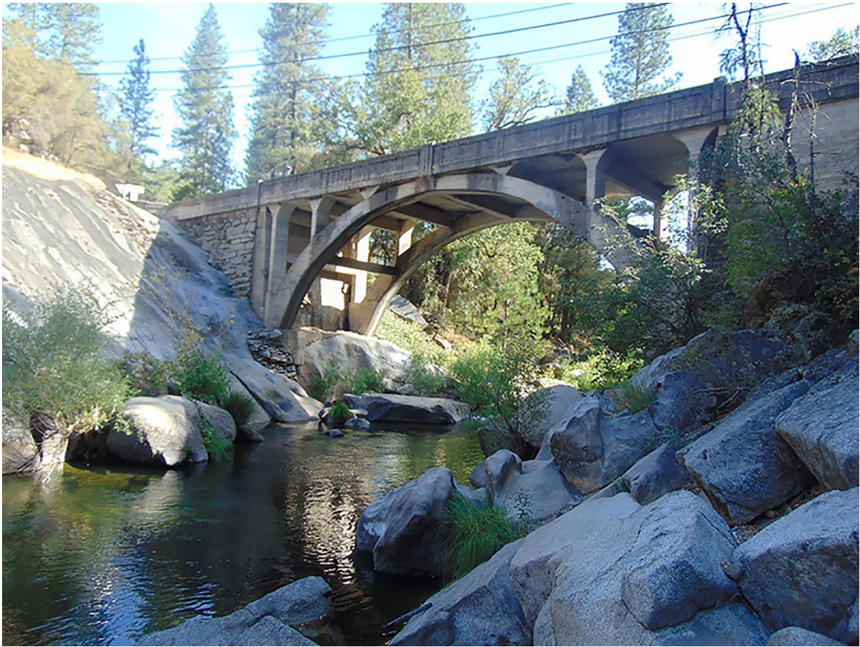
Bucks Bar Bridge, El Dorado County