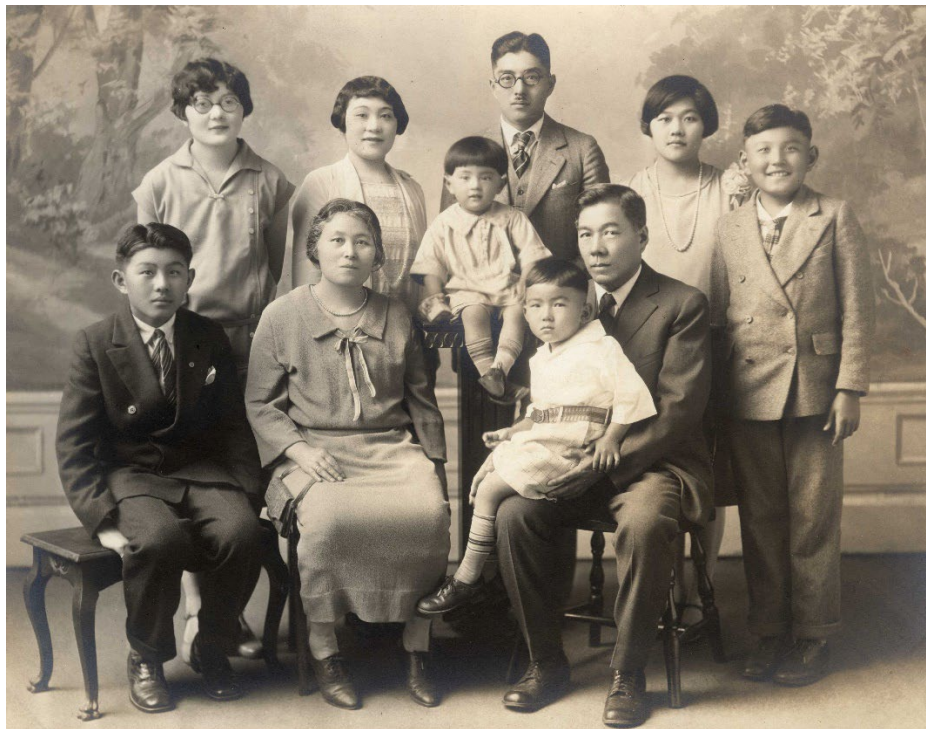
Harada House, Riverside, Riverside County

It is the responsibility of the Commission to review and approve Points nominations. Points are formally designated by the Director of State Parks.