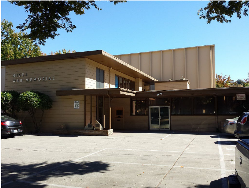
Nisei VFW Post, Sacramento, Sacramento County (Asian Americans and Pacific Islanders in California MPS)

religious values of the Native American groups who created them, and for the district's association with ceremonial solstice events.