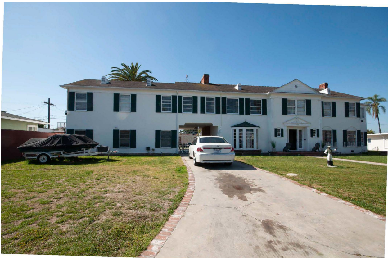
Anderson, Edmund, House, Los Angeles, Los Angeles County (African Americans in Los Angeles Multiple Property Document)