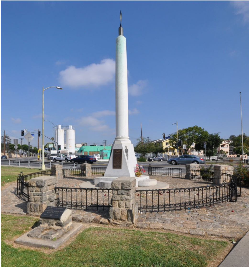
Chicano Moratorium 1969 March, Los Angeles, Los Angeles County

The State Historical Resources Commission is pleased to present its 2020 Annual Report to the Director of California State Parks and to the California State Legislature. The Annual Report summarizes the activities of the State Historical Resources Commission in 2020 and identifies future preservation goals pursuant to the provisions of Public Resources Code, Section 5020.4(a)(13). A complete description of the powers and duties of the State Historical Resources Commission is provided in Section 5020.4 of the Public Resources Code.